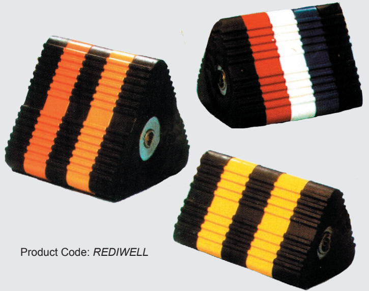
Product Code: REDIWELL